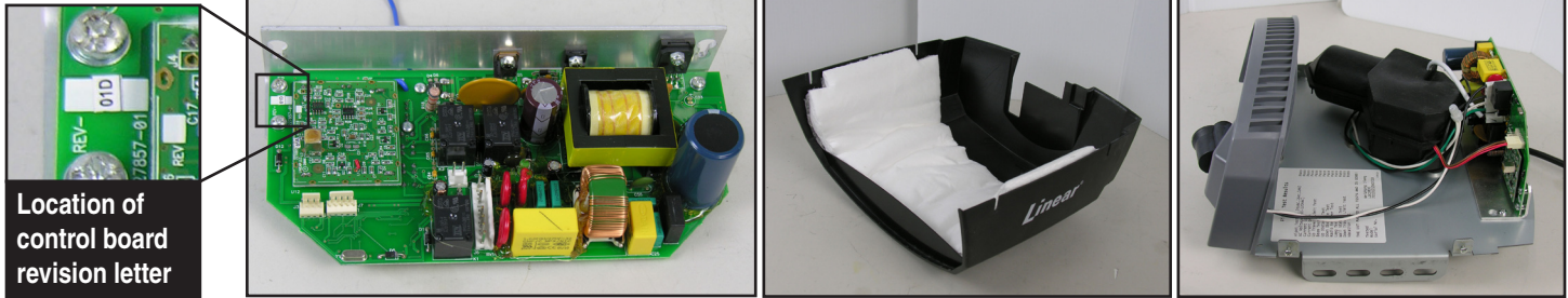
HAE00050 rev A, B, C, D or E

In August 2010, Linear introduced LDCO800 operator and its field replaceable control board HAE00050. Picture below shows key components to help you identify original LDCO800.